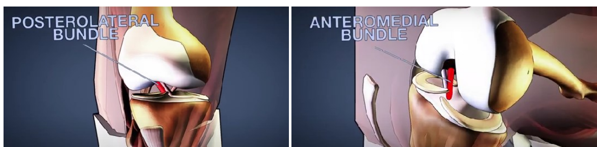
Figure 2. The anteromedial and posterolateral bundles of the ACL provide stability throughout the knee range of motion. (ReadySetMed 2014)