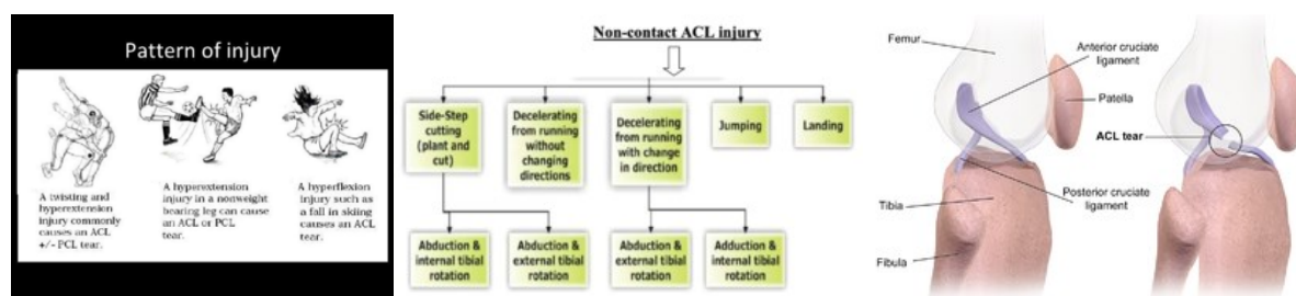
Figure 3. Mechanism of ACL injury in sports and ACL tear (Physiopedia 2017a)